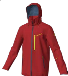
A67F Red Chili