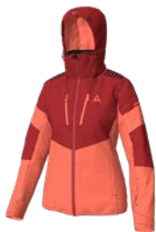
A62F Camellia Coral