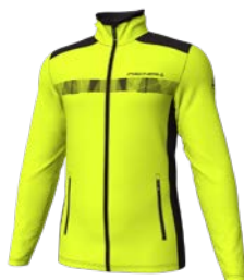
Q41F Evening Yellow