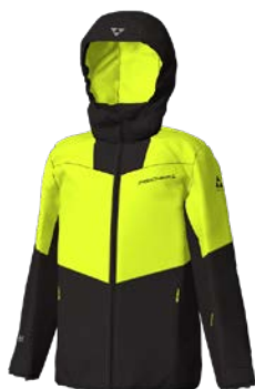
Q41F Evening Yellow