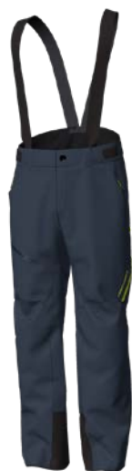
A28F Blue Nights