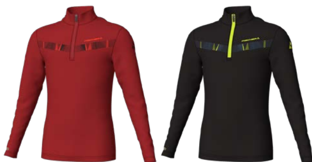
A67F Red Chili