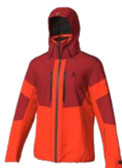
A65F Tomato Red