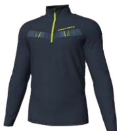
A28F Blue Nights