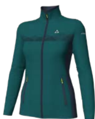
A59F Spruced Green