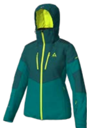
A57F Kayak Green