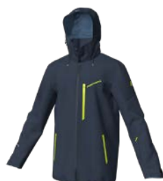
A28F Blue Nights