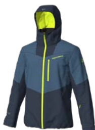
A26F Grey Sea