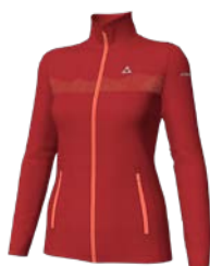
A67F Red Chili