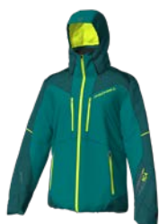
A57F Kayak Green