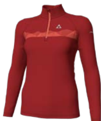
A67F Red Chili