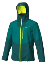
A57F Kayak Green