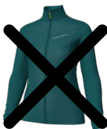
A59F Spruced Green