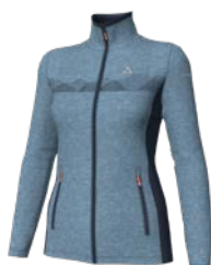
A27FM Windward Blue Melange