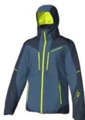
A26F Grey Sea