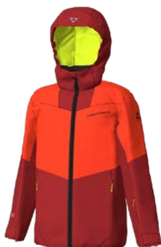
A65F Tomato Red