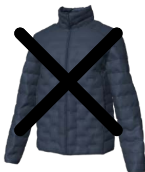
A28F Blue Nights