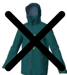
A59F Spruced Green