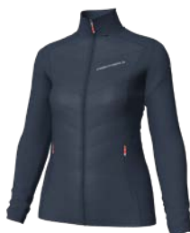
A28F Blue Nights