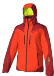
A65F Tomato Red