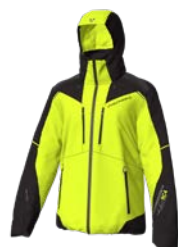
Q41F Evening Yellow