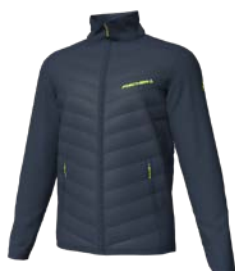
A28F Blue Nights