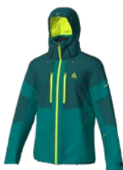
A57F Kayak Green