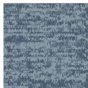
A27FM WINDWARD BLUE MELANGED 17-4018 TPG