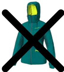
A57F Kayak Green