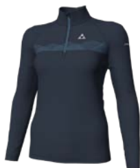
A28F Blue Nights