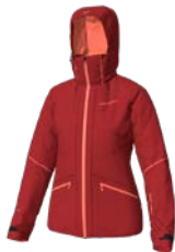
A67F Red Chili