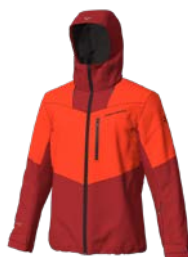
A65F Tomato Red