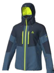
A26F Grey Sea