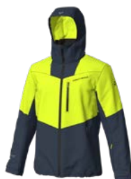
Q41F Evening Yellow