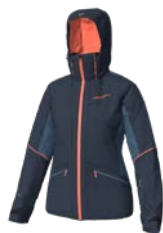
A28F Blue Nights