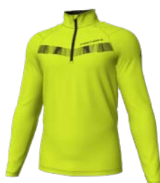
Q41F Evening Yellow