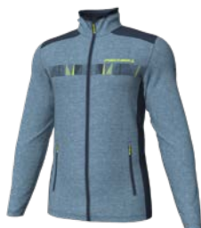
A27FM Windward Blue Melange