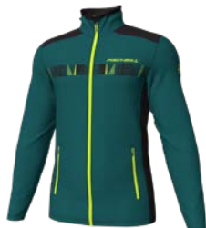
A59F Spruced Green