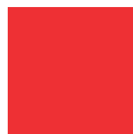
Q66F FIERY RED Pantone 18-1664 TCX