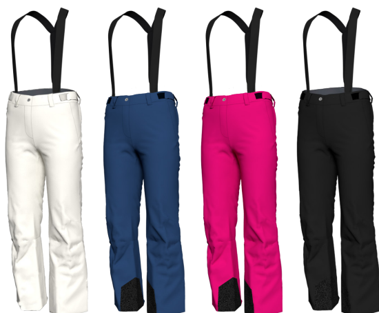
S00F Bright White