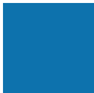
S35F BOLD BLUE Pantone 19-4150 TCX