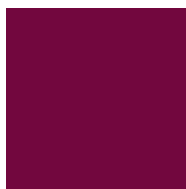
S68F POMEGRANATE RED Pantone 19-1930 TCX