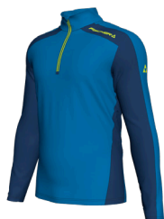
S35F Bold Blue