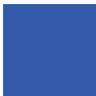
S37F WEB BLUE Pantone 19-3952 TCX