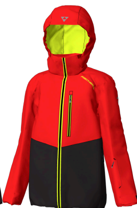
Q66F Fiery Red