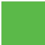
S53F TOUCAN GREEN Pantone 16-6230 TN