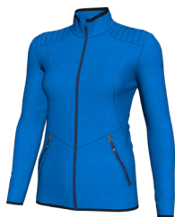
S37F Web Blue