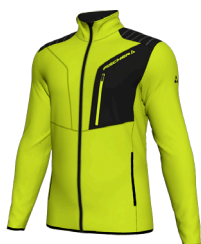
Q41F Evening Yellow