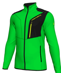
S53F Toucan Green