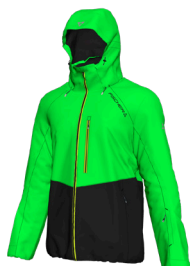
S53F Toucan Green