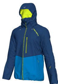
S35F Bold Blue