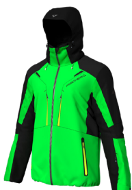
S53F Toucan Green