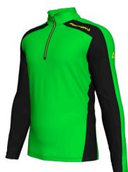
S53F Toucan Green