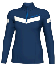
S39F Estate Blue