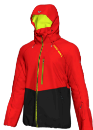
Q66F Fiery Red