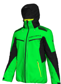
S53F Toucan Green