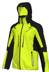
Q41F Evening Yellow