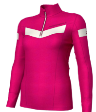
S64F Virtual Pink