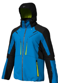
S35F Bold Blue