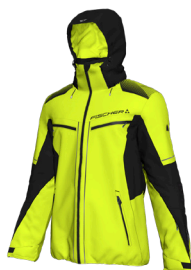
Q41F Evening Yellow