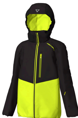
Q41F Evening Yellow