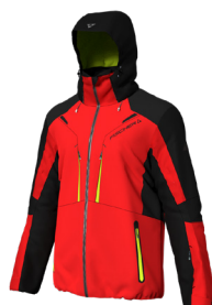
Q66F Fiery Red