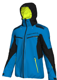
S35F Bold Blue