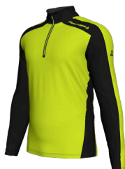
Q41F Evening Yellow