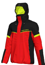
Q66F Fiery Red