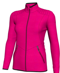
S64F Virtual Pink