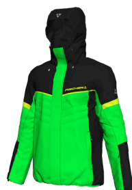
S53F Toucan Green