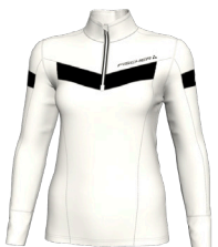
Q00F Bright White