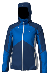
S37F Web Blue