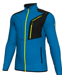
S35F Bold Blue