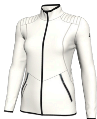
Q00F Bright White