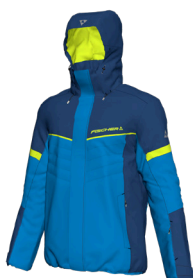
S35F Bold Blue