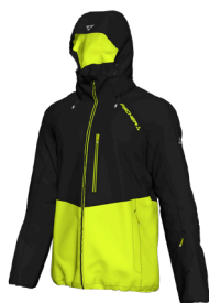
Q41F Evening Yellow