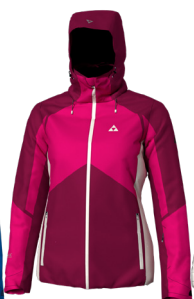
S64F Virtual Pink