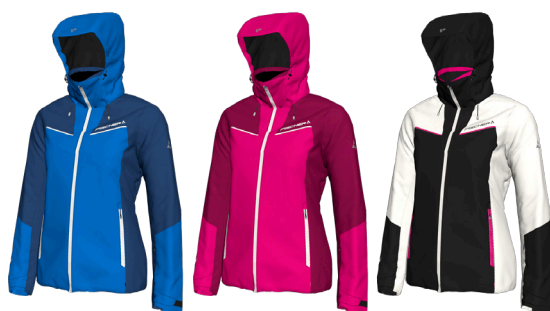
S37F Web Blue