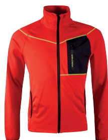
Q66F Fiery Red