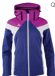
Q35F Deep Blue