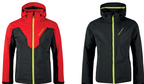
Q66F Fiery Red