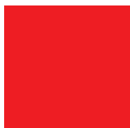
Q66F 18-1664 TCX FIERY RED