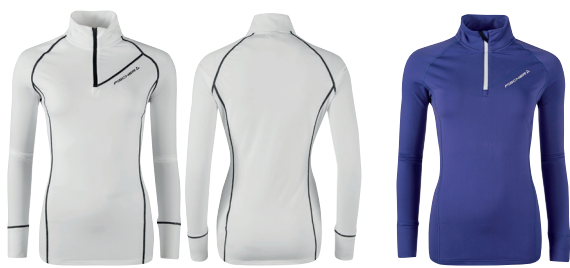
Q00F Bright White