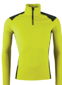
Q41F Evening Yellow