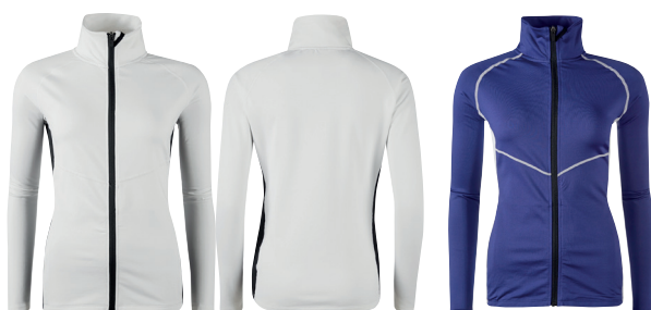
Q00F Bright White Q35F Deep Blue