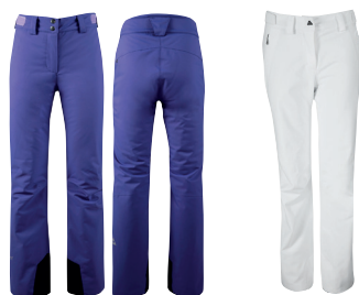
Q35F Deep Blue Q00F Bright White