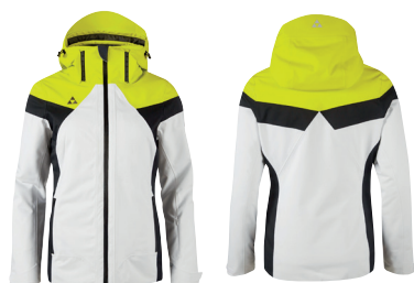
Q00F Bright White