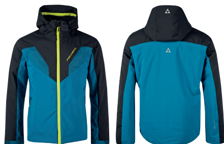
Q36F Moroccan Blue