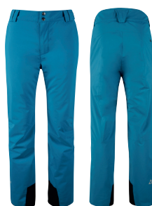
Q36F Moroccan Blue