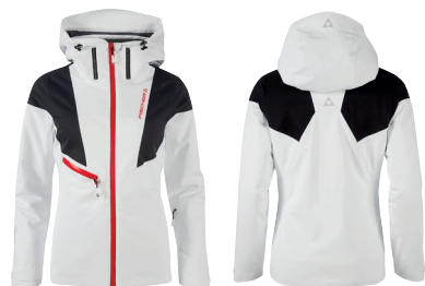
Q00F Bright White