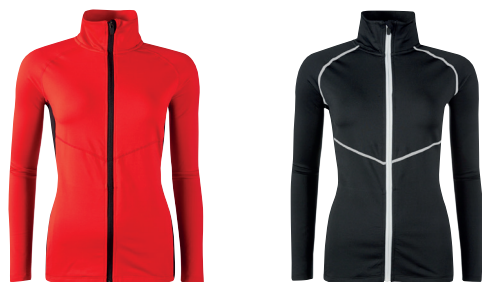
Q66F Fiery Red Q99F Black