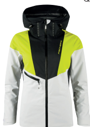
Q41F Evening Yellow