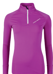
Q62F Purple Flower