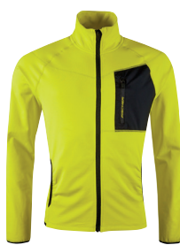
Q41F Evening Yellow