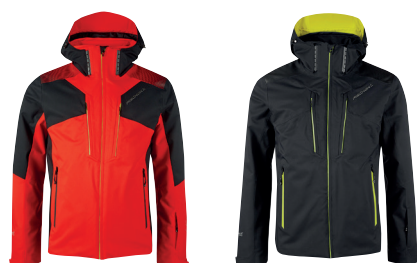
Q66F Fiery Red