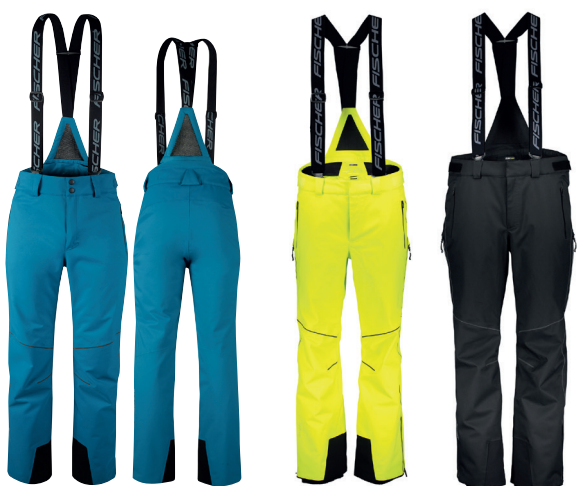
Q36F Moroccan Blue