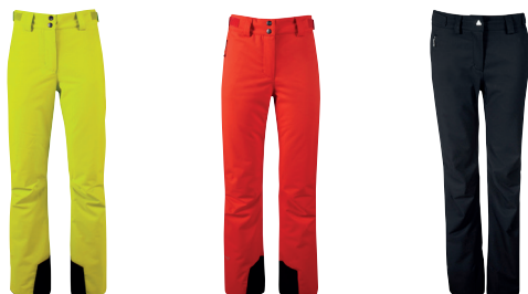
Q41F Evening Yellow Q66F Fiery Red Q99F Black