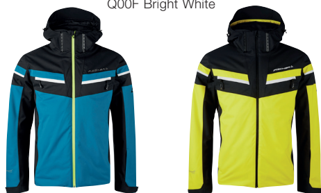
Q36F Moroccan Blue