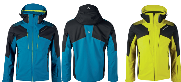
Q36F Moroccan Blue