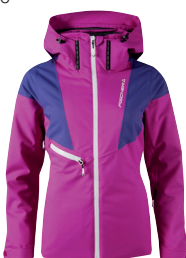
Q62F Purple Flower