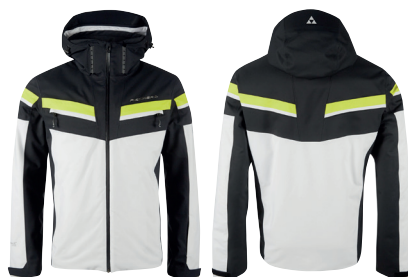
Q00F Bright White