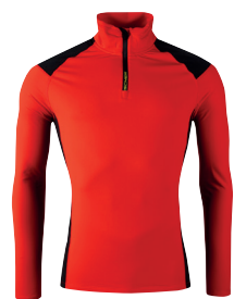
Q66F Fiery Red