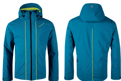
Q36F Moroccan Blue