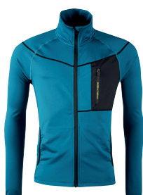
Q36F Moroccan Blue