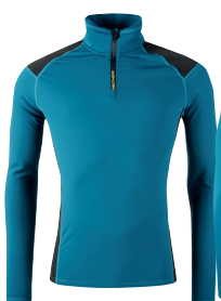
Q36F Moroccan Blue